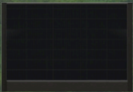
1 Gravel Board Height - 1284mm