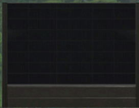
2 Gravel Board Height - 1434mm