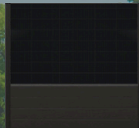
4 Gravel Board Height - 1734mm