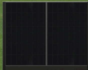
1 Gravel Board Height - 1912mm

All Black - Bi-facial 2 Panels - 900W per bay 1st bay width - 2418mm Additional bay width - 2343mm