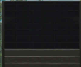
3 Gravel Board Height - 1584mm