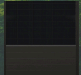
5 Gravel Board Height - 1884mm